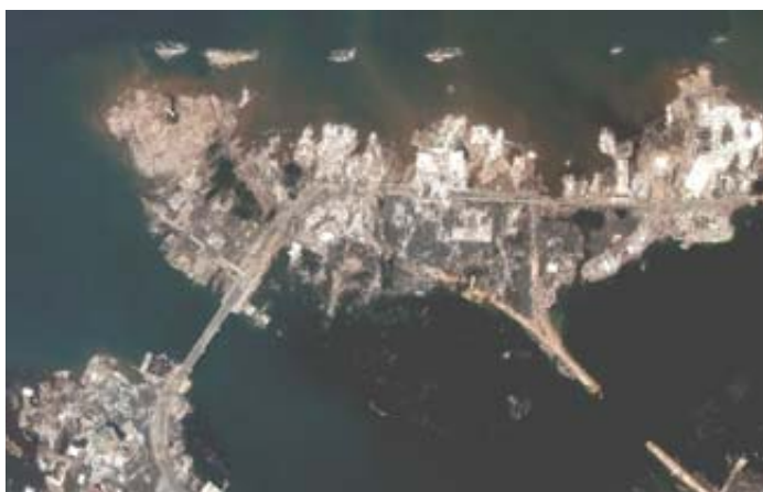
SUBMERGED: Part of the Indonesian city of Banda Aceh, on the northern tip of the island of Sumatra, was wiped away, as seen in these satellite images before the tsunami ( top ) and after ( bottom ).

A year of death and destruction wreaked mostly by humans ended with nature flexing her own muscles, to terrifying effect. A section of the earth's crust hundreds of kilometers long tore off its moorings, slamming into the seawater above. The resulting tsunami traveled at 700 kilometers per hour to rear up like a hydra onto shores, sweeping away some 225,000 lives and millions of livelihoods across 12 nations. Now, as broken-hearted survivors turn to piecing together the remnants, scientists are scrutinizing the oceanic and island terrain to determine how the crust has changed and to gauge what further horrors the earth may have in store.