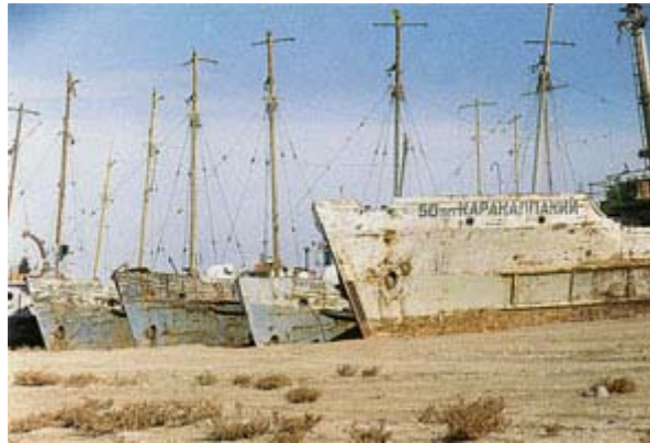
Boats in the Aral Sea

Water is one of the most precious resources on the planet. While it doesn't take long without it for us humans to remember how important water is to us, and how we cannot survive without it for more than a few days, we can often forget or overlook how intricate a part it plays in the survival of the rest of earth's inhabitants. Often through history, it seems to me that humans will pollute and disrupt water systems as much as they can or need to until it affects them directly. Most people you ask will probably be aware that there is a water crisis facing much of the world, or at least how important access to drinkable water is and that many countries in desert climates have very serious problems with it. However, many less are aware of the crisis that we are and will continue to be facing in relation to our salt lakes, or the reasons and possibilities for saving them.