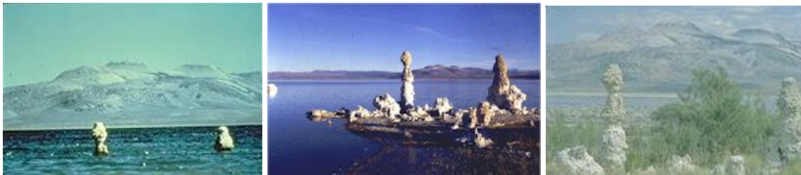
Photos of Mono Lake in 1962, 68, 95 following the lake dropping from 25 to 40 ft ( http://www.monolake.org/politicalhistory/index.html )

Over 760,000 years old, Mono Lake is one of North America's oldest sources of life, supporting human life for over five thousand years. Paiute Native Americans living around the lake used to collect the pupae of the lakes alkali flies and were thus given the name Monache, meaning "fly-eaters". In the 1850s, explorers shortened Monache to Mono, which has since been applied to the region and its inhabitants (USDA "Mono Basin" flyer). It took less than a hundred years after their discovery of the lake for these European settlers to begin diverting its waters. In 1941, the city of Los Angeles began diverting water from Mono Lake, unknowing and uninterested of its ecological significance. Within forty years, the lake had dropped nearly fifty vertical feet, lost half its volume and doubled in salinity, threatening the ability of the lake to support life ( http://www.livinglakes.org/mono/ ).