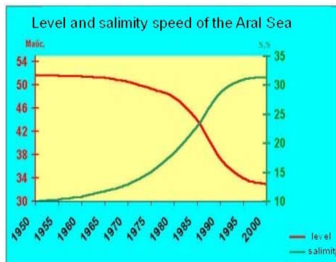
Salinization increased from 10 g/l to 40-50 g/l because of lack of fresh water inflow. ( http://www.grida.no/ara/aralsea/english/arsea/arsea.htm )

Until 1960, the Aral Sea was the fourth largest lake in the world, it is now the world's eighth largest ( uky.edu/ArtsSciences/Geology/rimmer/110/AralSea.pdf ). As the lake dropped, its salinity increased ten fold to the point where the lake could no longer support its previously rich fish population. In the 1980s the commercial fishery had been eliminated, totally closing an industry that had employed 60,000. The increase in salinity drove some of the lake's 24 species of fish to extinction while others can be found elsewhere. Wetlands and oases around the lake disappeared with the receding lake and falling water table. Many of the area's mammals and 173 species of birds were driven away due to habitat loss ( american.edu/ted/ARAL.HTM ).