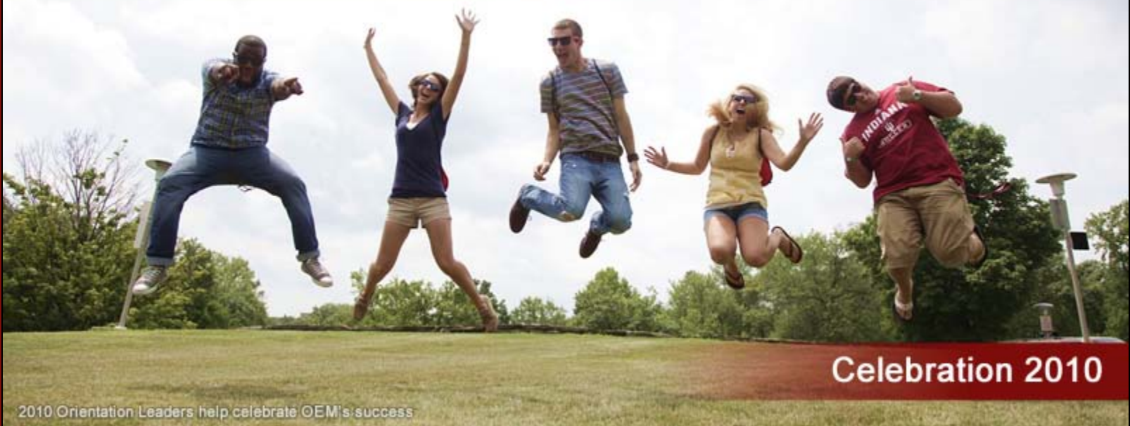
2010 Orientation Leaders help celebrate OEM's success