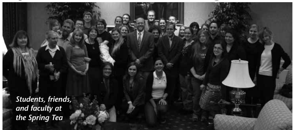
Students, friends, and faculty at the Spring Tea

Nurturing strong connections with other units is extremely valuable, and can only help Slavic to prosper and flourish. It is my expectation that future joint hires may be the norm, rather than the exception. Previous to Emery's, mine — with the Department of Linguistics — was the only such position (and I came to IU in 1987!). Our health, in my view, rests on our interdisciplinarity and versatility, and I can anticipate possible positions shared not just with the departments of Comparative Literature and Linguistics, but with departments such as Folklore, Anthropology, Religious Studies, and Communication and Culture, to name but a few. And while at the moment this issue of DOSLAL goes to press no hiring authorizations have been announced, over the next few years I expect a steady stream of new hires in Slavic, beginning in the fall with a much-needed search for a senior faculty member.