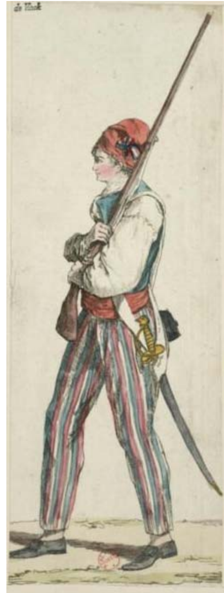
anonymous, "a sans-culottes"

popular insurrection — representatives of the people