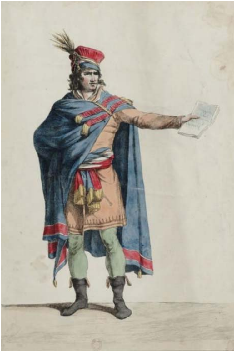
Jacques Louis David, "design for the uniform of a Representative of the People" (1794/Year 2)