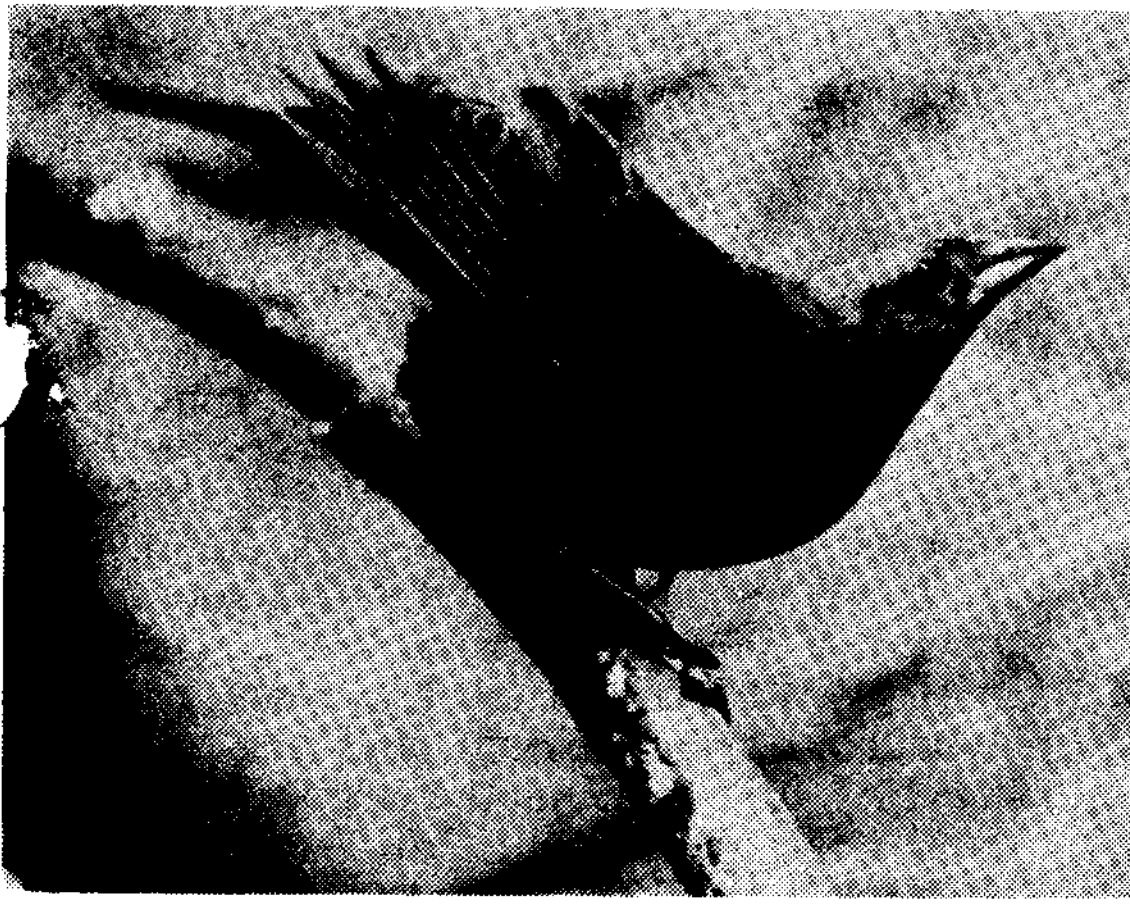
Fig. 1. Female cowbird displaying the copulatory response.