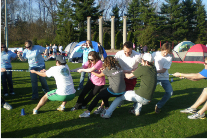
Above: APO members participate in a tug of war during Relay for Life.