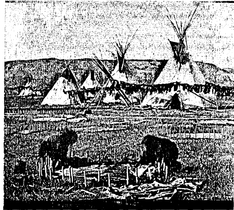
Figure 4.1. Northern Cheyenne women tanning buffalo hides, mouth of the Yellowstone River, circa 1878. From stereo card by Stanley J. Morrow. Used with permission of the National Anthropological Archives (NAA neg #3701).

Of all of the photographs, paintings, and drawings of women from the Plains, woman as hideworker is one of the most pervasive. These images usually portray multiple women sitting on the ground scraping a stretched-out hide, with tipis and hanging dried meat in the background (figure 4.1). This icon of female labor has been called the “drudge on a hide” by Gifford-Gonzalez (1993), which confers a sense of social submission to the viewer. However, unlike artists’ illustrations of life in the Paleolithic period, these eyewitness photographs and illustrations show