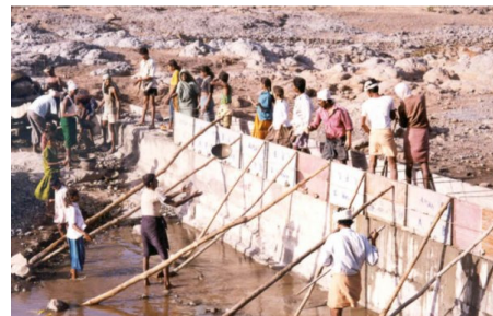
“Saathi Haath Badhana!” (Friend, join hands) Bilgaon villagers building the check dam